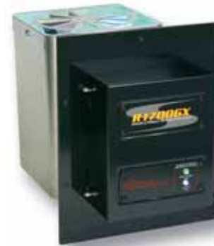
Up to 1700 sq. ft Home