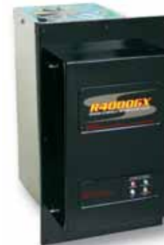
From 1500 sq. ft to 4000 sq. ft Home *Commercial 2000 cfm model also available