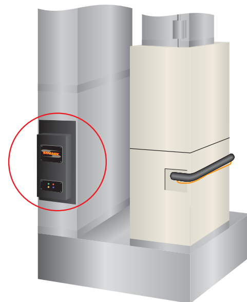
Return or Supply Plenum Installation